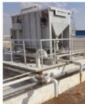
INDUSTRIAL ETP PLANTS (Industrial Effluent Treatment Plants)