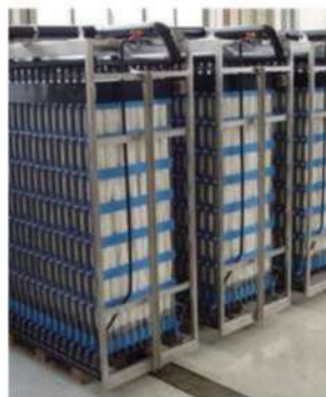
MBR STP Plant (Membrane Bioreactor Sewage Treatment Plant)