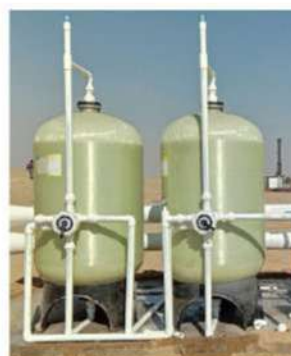
SEAWATER DESALINATION (Seawater Desalination Reverse Osmosis Plant)