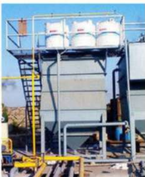
ETP PLANTS (Effluent Treatment Plants)