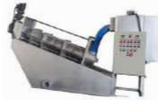
SLUDGE DEWATERING SCREW PRESS