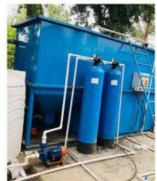
MBBR STP Plant (Moving Bed Biofilm Reactor Sewage Treatment Plant)