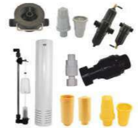
MPV SPARES & ACCESSORIES