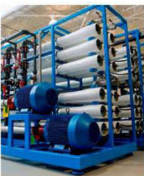
INDUSTRIAL RO PLANTS (Industrial Reverse Osmosis Plant)