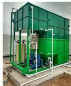
SBR STP Plant (Sequencing Batch Reactor Sewage Treatment Plant)