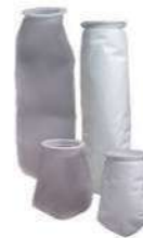
BLUE HOUSING FILTER BAGS