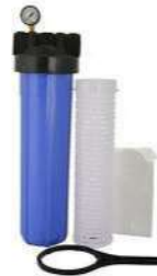
BLUE HOUSING FILTER