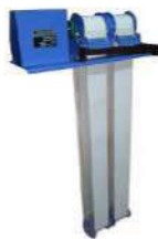
BELT TYPE OIL SKIMMER