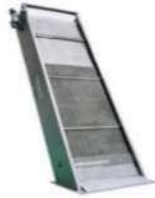
MECHANICAL BAR SCREEN