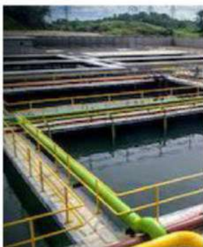
EA STP Plant (Extended Aeration Sewage Treatment Plant)