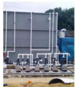
Compact / Portable ETP (Compact / Portable Effluent Treatment Plants)