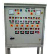
ETP & STP PANEL