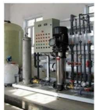
INSTITUTIONAL RO PLANT (Seawater Desalination Reverse Osmosis Plant)