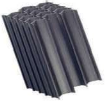
TUBE SETTLER MEDIA