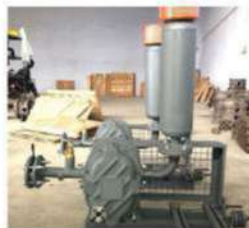
TWIN LOBE AIR BLOWER