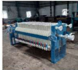
PLATE & FRAME TYPE FILTER PRESS