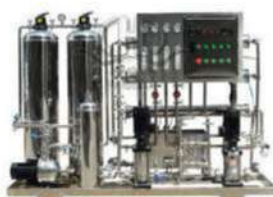
SS RO Plant (Stainless Steel Reverse Osmosis Plant)