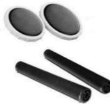
COURSE BUBBLE DIFFUSERS