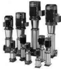
HIGH PRESSURE PUMPS