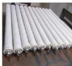
FINE BUBBLE DIFFUSERS