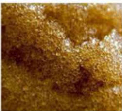
ION EXCHANGE RESIN