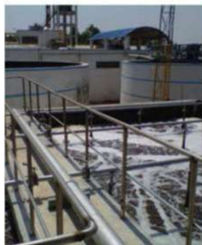
CETP PLANTS (Common Effluent Treatment Plants)