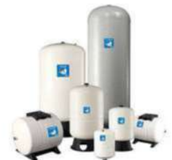
PRESSURE PUMPS TANK